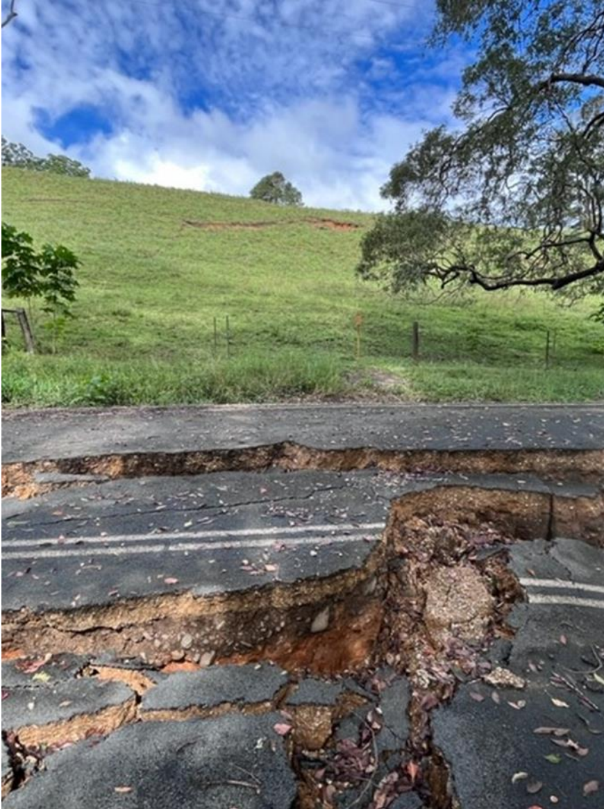
Figure 3 - Tyalgum Road