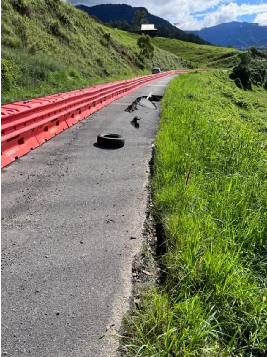
Figure 7 - Zara Road