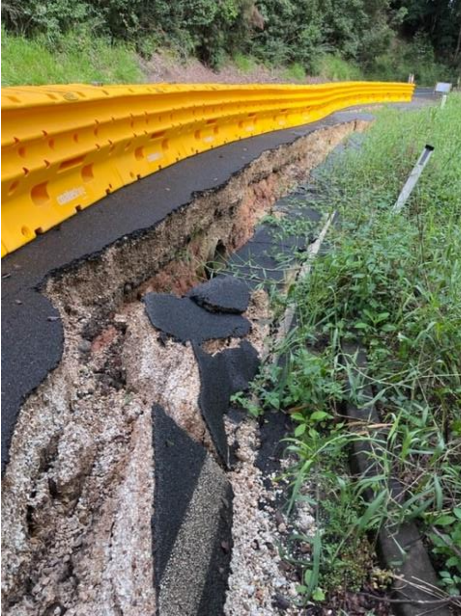
Figure 4 - Tyalgum Road