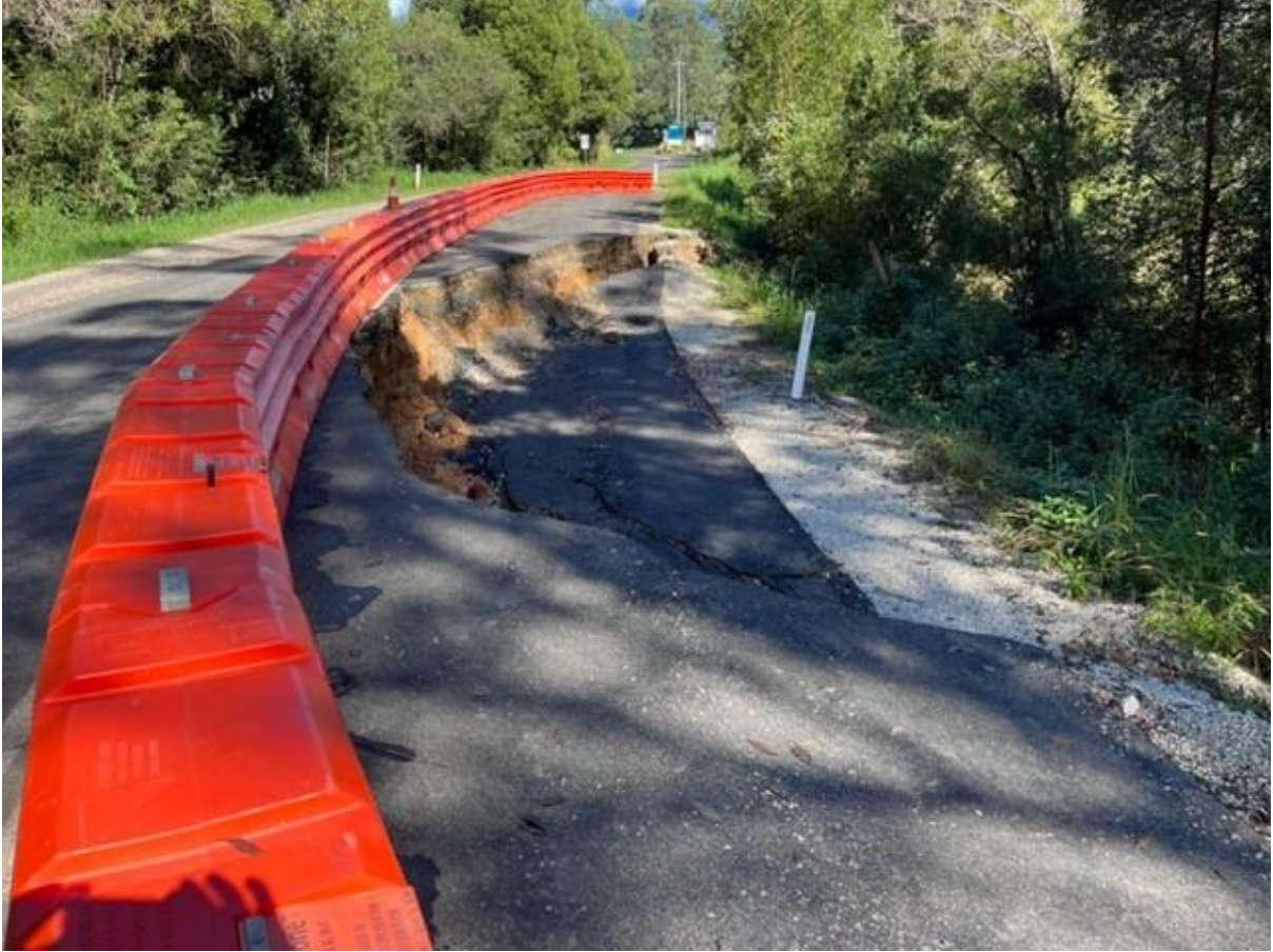
Figure 8 - Zara Road opposite Charbray Place