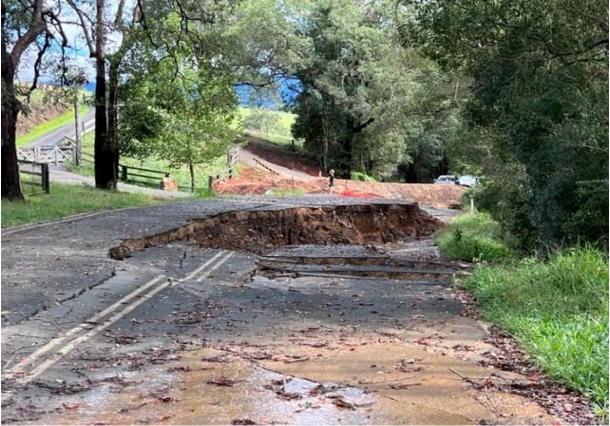
Figure 2 - Tyalgum Road