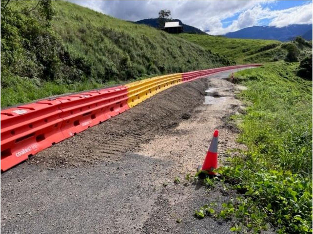
Figure 6 - Zara Road