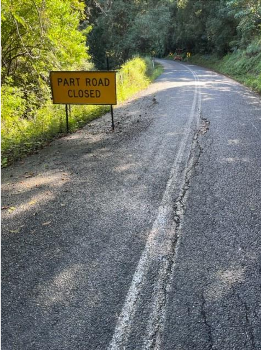
Figure 5 - Numinbah Road