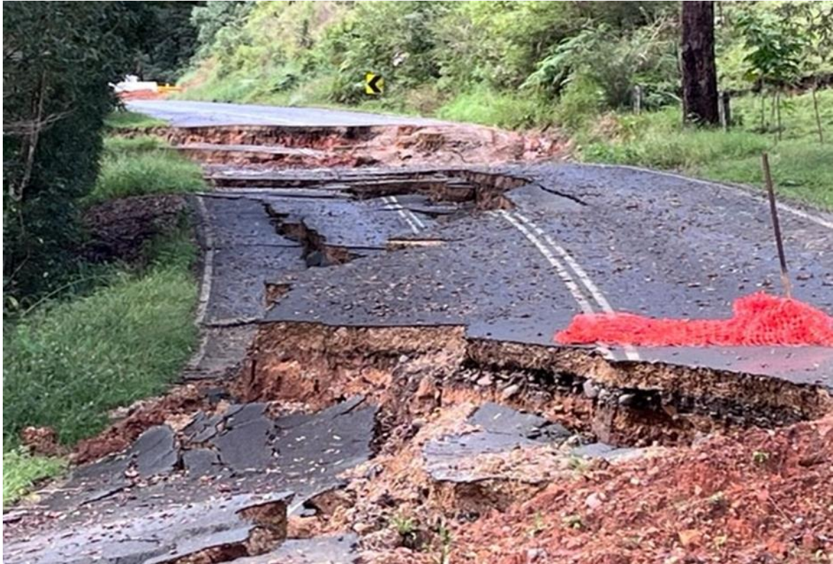
Figure 1 - Tyalgum Road

Attachment 3. Photos of the main landslip on Tyalgum Road, the secondary Landslips on Tyalgum Road and landslips on Zara and Numinbah Roads.