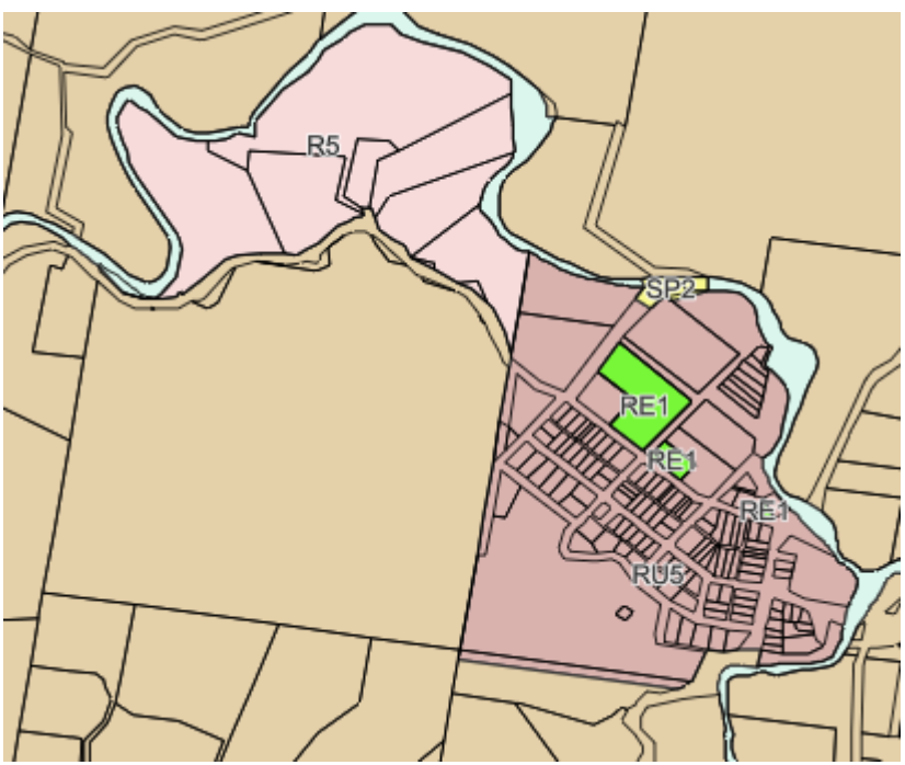
Figure 2-Tyalgum Village-note the undeveloped RU5 portion to the south west of the Village